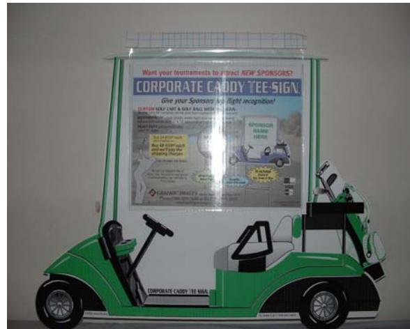
Above is a photo of the tee sign that will be used at this years Golf Tournament. Tee signs are just $50.00 each